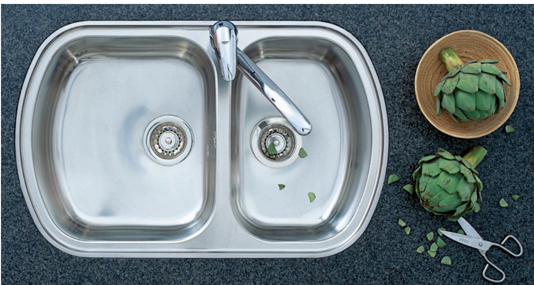
Client: Ifö Product: Concert